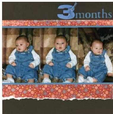
Page by Deb Schroeder

we start with the same product, but have such different results! Our awesome pages are posted in the store for a month... come check them out, or better yet, join us!