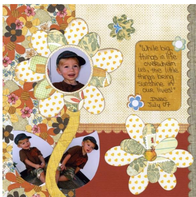
Page by Carri Renchin

Our scrappers are always looking for a new challenge. In this group, each month we all start with the same product collection to make a page spread. It's amazing to me how we start with the same product, but have such different results! Our awesome pages are posted in the store for a month, and online in our Gallery (thanks Miss Deb!)... come check them out, or better yet, join us, it's SUCH fun!!