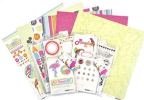
> pina colada