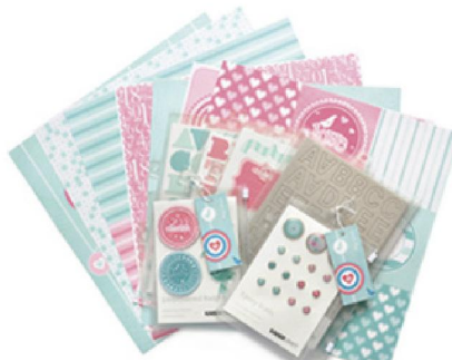
> child's play