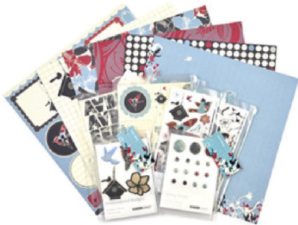
> loire valley

Everyone has a story; we help you tell yours.